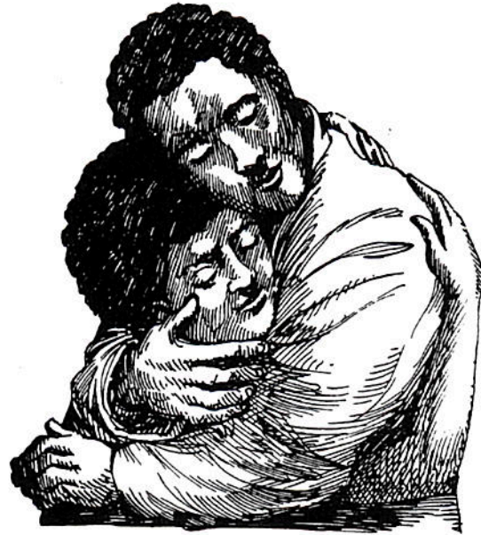
Minority theater began achieving success in the 1960s.

Today's theater is a mix of styles. The theater is experiencing a period of growth. Audiences are increasing as more and more people enjoy the unique experience of witnessing live theater.