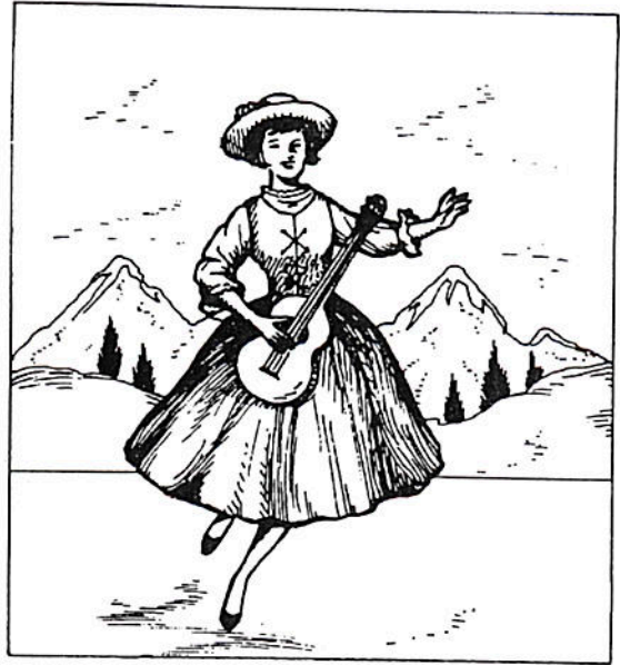
Rodger's and Hammerstein's The Sound of Music

Englishman Andrew Lloyd Webber is also important in modern musical history. Webber's musicals include Cats , Phantom of the Opera , and Evita .